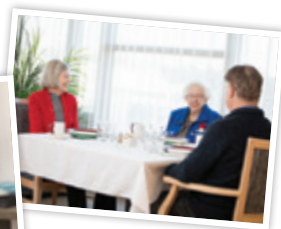
Daily dining in the company of new friends

Availability for certain floor plans is becoming limited. Don't miss out! Call now for the best selection of private suites.