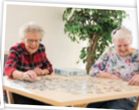
Enjoy an active social life