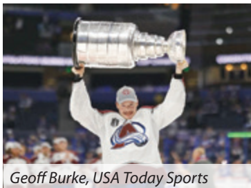
Geoff Burke, USA Today Sports