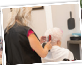
Pamper yourself at the salon