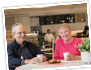
Treat yourself at the Bistro