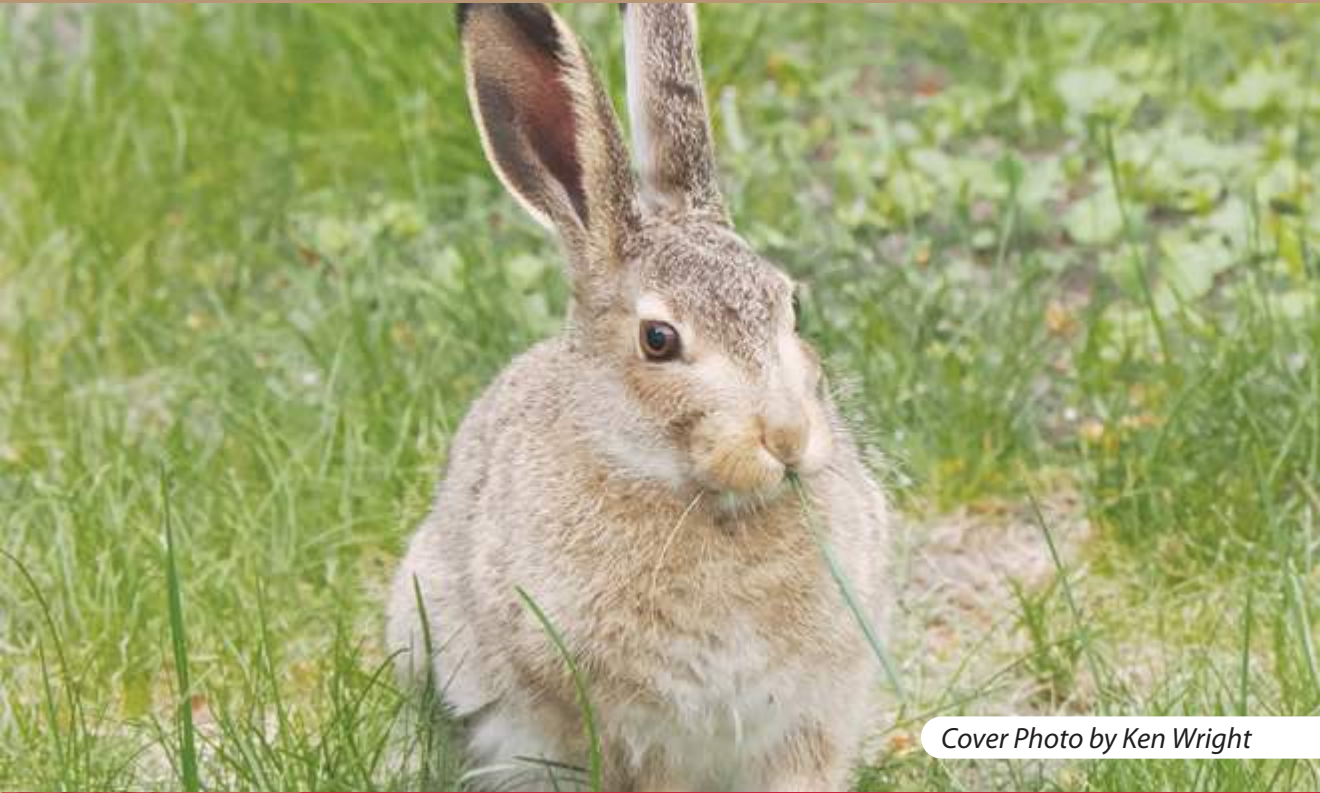
Cover Photo by Ken Wright

THE OFFICIAL BRENTWOOD COMMUNITY NEWSLETTER