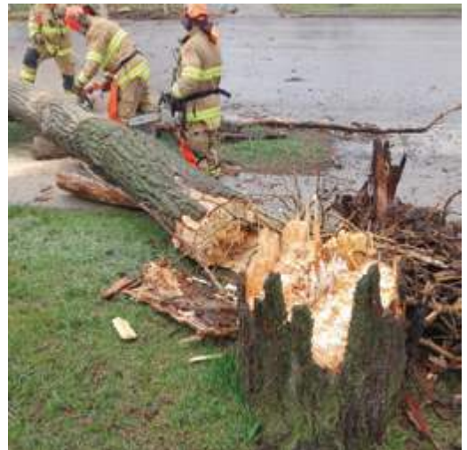
Downed Poplar after May storms in Brentwood.