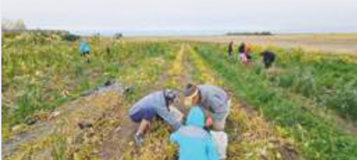
Harvest time at the farm

Are you an Executor? Don't know what to do?