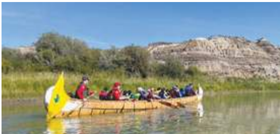
Cubs canoeing Red Deer River in voyageur canoe

A sleepover at the Tyrell Museum is planned for later in the fall for Beavers and Cubs.