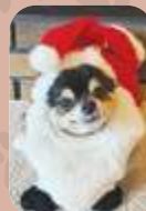
Pedro, Sandstone Valley