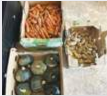
First food donation

Thanks so much to Jo and the students for sharing the bounty with those in need and contributing much-needed fresh vegetables.