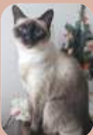
Echo, Signal Hill