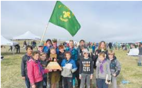
Scouts with their 1st place trophy from Great Escape