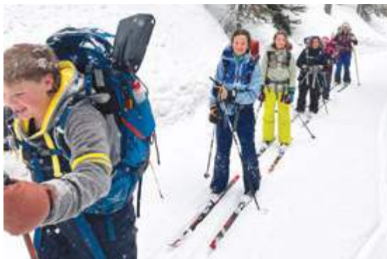
Scouts Skiing over Elk Pass

A highlight for the Scouts (ages 11 to 14) was a cross-country ski trip over the Elk Pass into BC, with an overnight stay in an alpine hut.