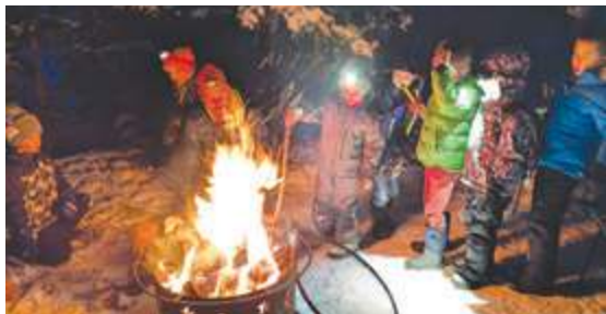
Beavers at Winter Camp

Beavers (ages 5 to 7) enjoyed a fall overnight camp at Wayne and a winter sleepover at Camp Chief Hector, as well as skating and fun activities at Triwood Hall including homemade mini golf.