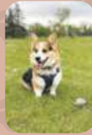
Moony, Lake Bonavista