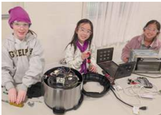
Cubs Learning How Things Work (or Don't) at Take-Apart Night in Triwood

Cubs (ages 8 to 10) joined the older sections on an overnight fall hike to Pickle Jar Lakes near Highwood Pass, learned rock climbing and scuba diving skills, and hosted a north Calgary area Cub Car derby.