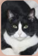
May, Elbow Park